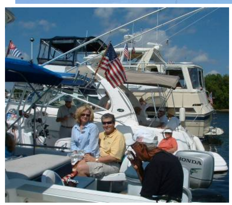
Raft-Ups are Fun—For Raft-Up & Rendezvous information, see page 5.