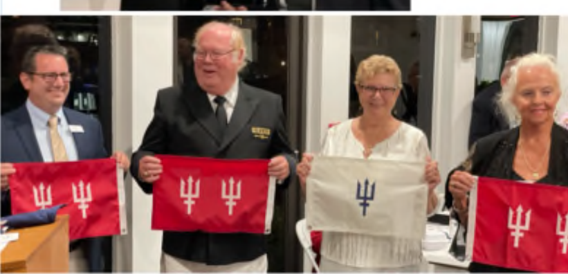
Past Commanders passing the flag. Is it anything like passing the 'buck'?