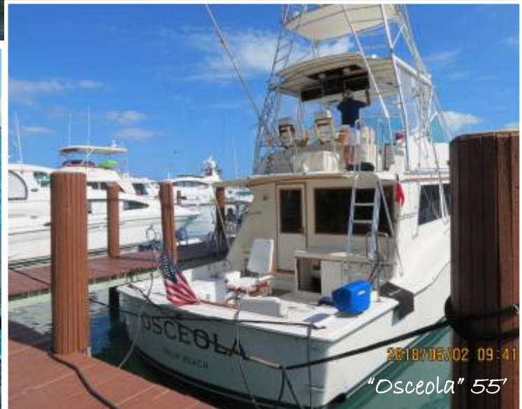
2018/09/02 09:41 "Osceola" 55'