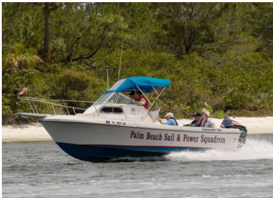
Commander One on a training maneuver . . . .

RETURN ADDRESS Palm Beach Sail & Power Squadron 1125 Old Dixie Hwy., #1 Lake Park, FL 33403