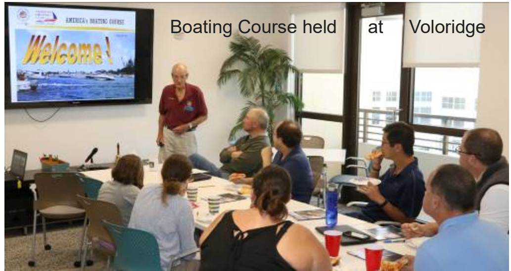
Boating Course held at Voloridge

Another reminder: an Instructor Qualification recertification class is scheduled for the Fall District 8 Conference 26 - 28 October. If you are a Certified Instructor with certification that expires this year or next year, you should take advantage of this.