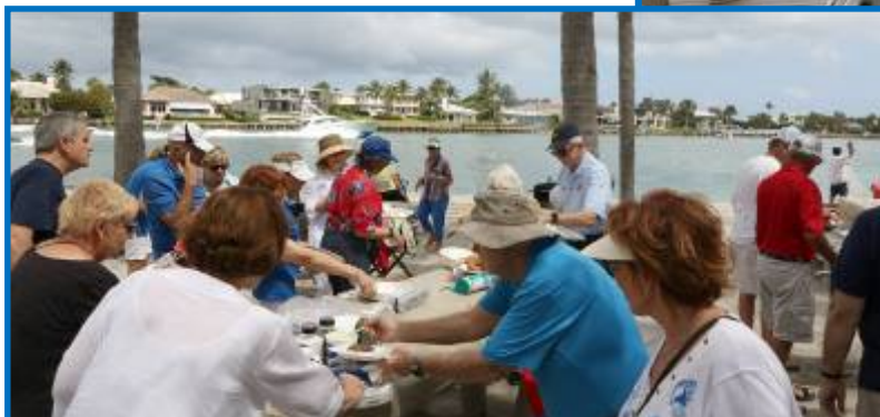
Raft-Up Picnic - 9 March Dubois Park, Jupiter