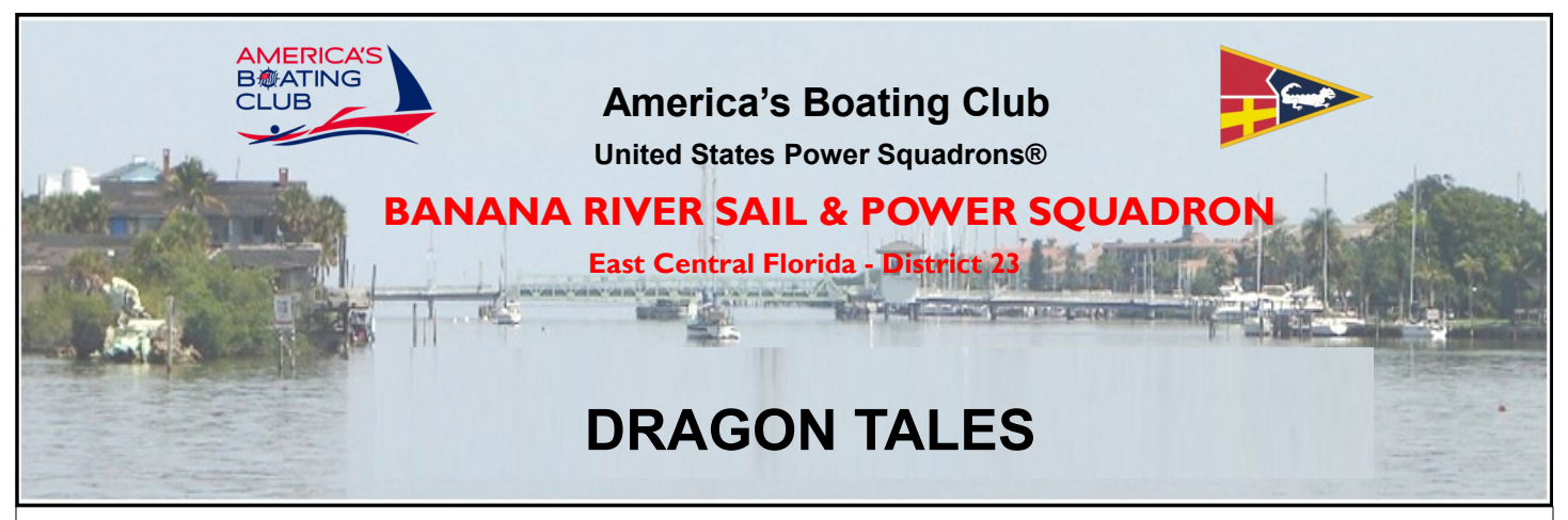
Volume 63; Number 7