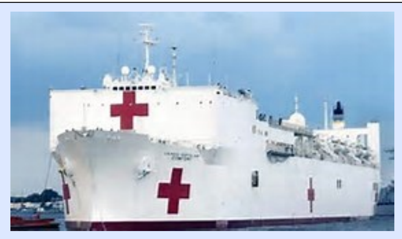
USNS Comfort on its way to help New York City!