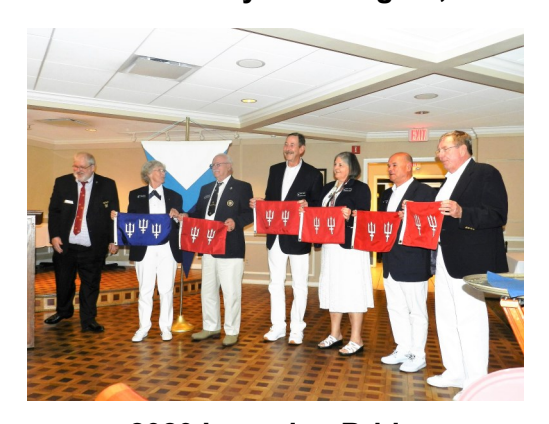
2020 Incoming Bridge